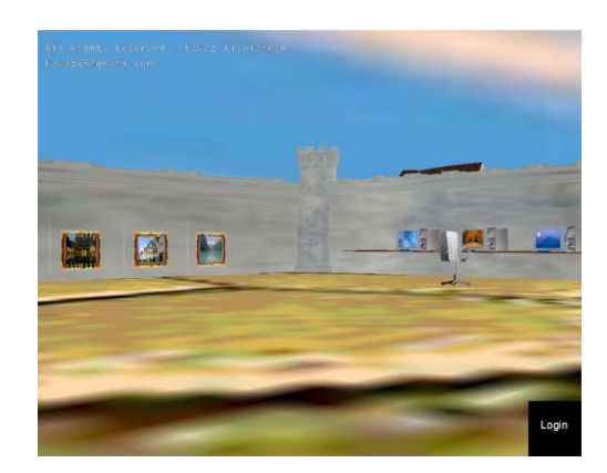
Fig.2. Snapshot of a proof-of-concept virtual art gallery, which contains 36 pictures and six computers

Fig.1. Snapshot of a proof-of-concept 3-D virtual environment, where the user is typing a textual password on a virtual computer as a part of the user's 3-D password.