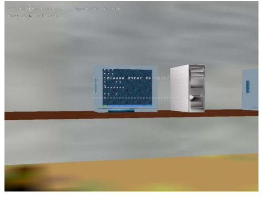
Fig.1. Snapshot of a proof-of-concept 3-D virtual environment, where the user is typing a textual password on a virtual computer as a part of the user's 3-D password.

(1, 18, 80) Action = Drawing, point = (330, 130). This representation is only an example. In order for a legitimate user to be authenticated, the user has to follow the same sequence and type of actions and interactions toward the objects for the user's original 3-D password. Fig. 1 shows a virtual computer that accepts textual passwords as a part of a user's 3-D password. Three-dimensional virtual environments can be designed to include any virtual objects. Therefore, the first building block of the 3-D password system is to design the 3-D virtual environment and to determine what objects the environment will contain. In addition, specifying the object's properties is part of the system design. The design of the 3-D virtual environment influences the overall password space, usability, and performance of the 3-D password system. Fig. 2 shows a snapshot of an experimental 3-D virtual environment.